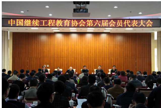
The 6 th CACEE General Meeting

CACEE is a national level social organization. 56 standing member orgs, 168 council member orgs. EC member of AEESEAP, IACEE.