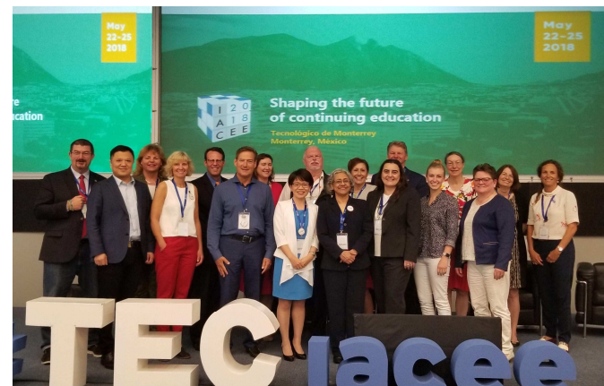
The 16 th IACEE World Conference

China Association for Continuing Engineering Education